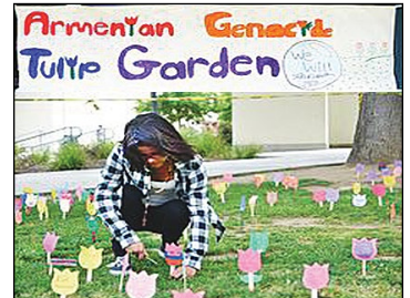
A memorial "Tulip Garden" planted on the grounds of Fresno's Duncan Polytechnical High School.