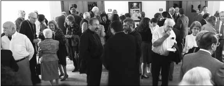
Guests at the Inaugural Banquet.