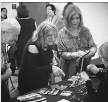
Guests had an opportunity to shop and take home an event treasure.