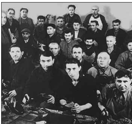
Labor Camp Shoemakers