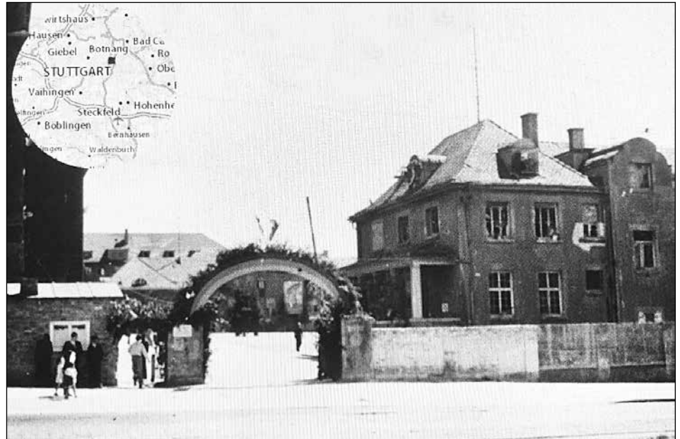
Funkerkasserne DP camp